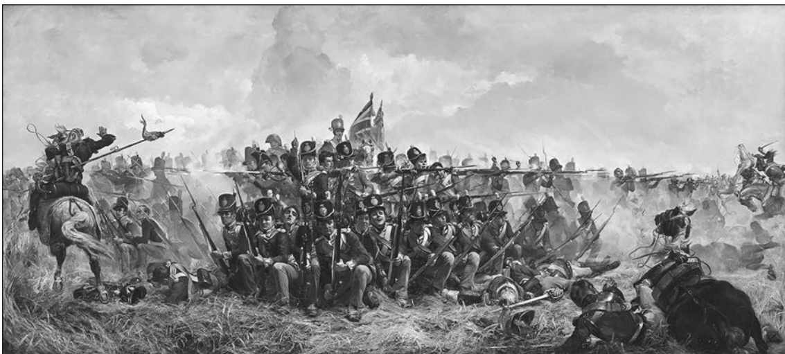
[British soldiers in the Napoleonic War]