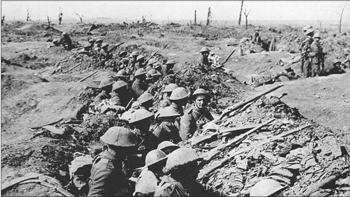
[British troops during the First World War]

Use Sources A, B and C to identify one similarity and one difference in changes in battle tactics over time. [4]